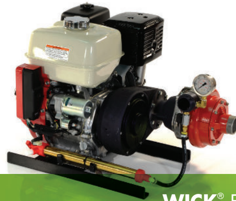
WICK® F200-13H (CHANNEL FRAME / HORIZONTAL SPEED INCREASER MODEL)