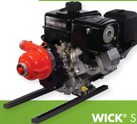
WICK® Si 300-10B